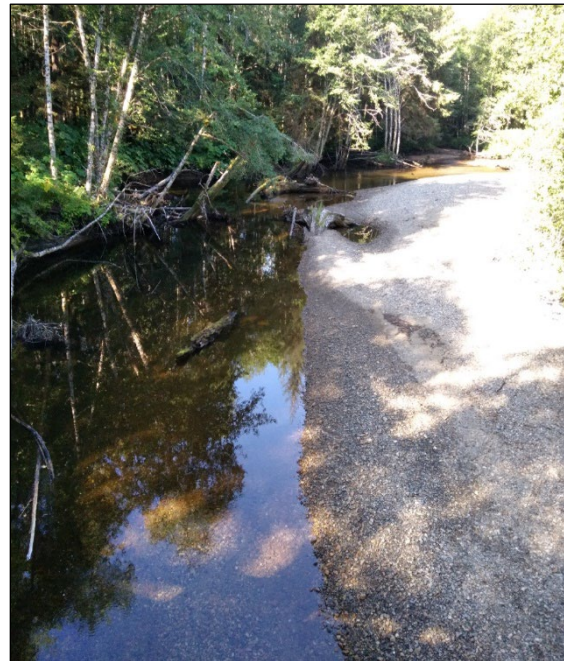
Figure 2. Upstream at waypoint 588.