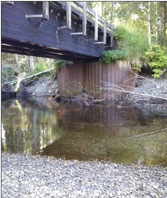
Figure 1. Bridge and channel at waypoint 588.